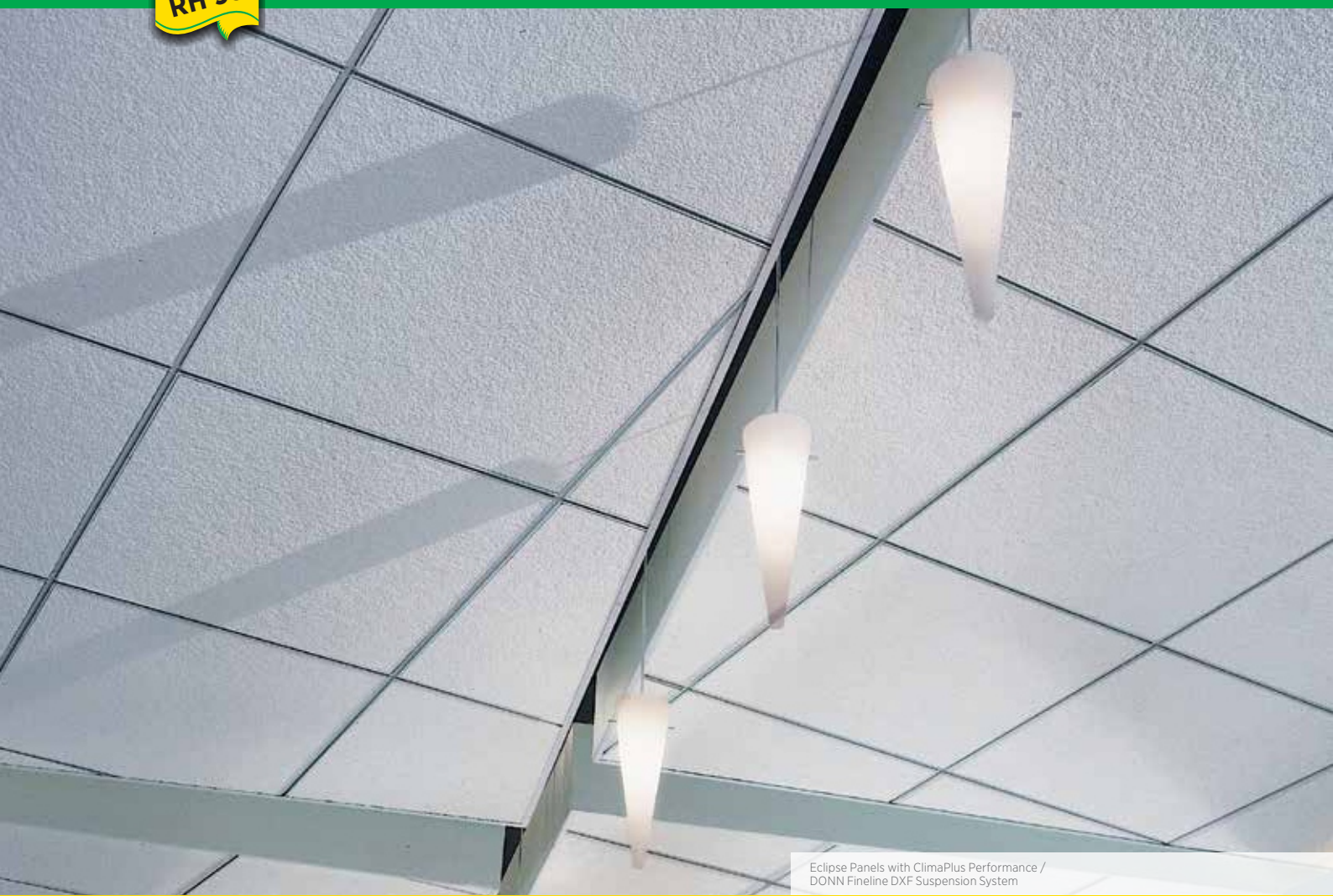
Eclipse Panels with ClimaPlus Performance / DONN Fineline DXF Suspension System